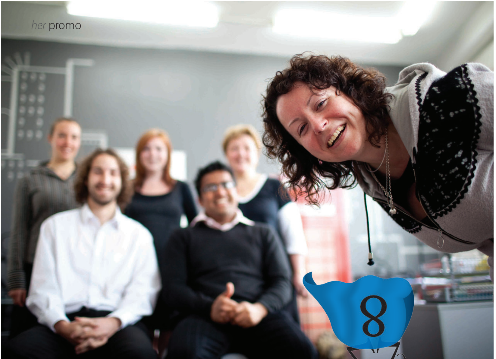
figure it out